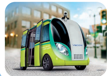
▲ In-vehicle Computing