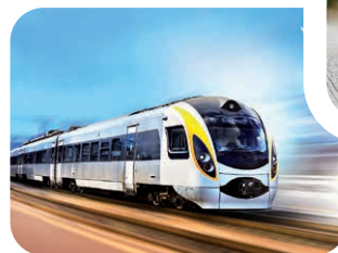
▼ Rolling Stock