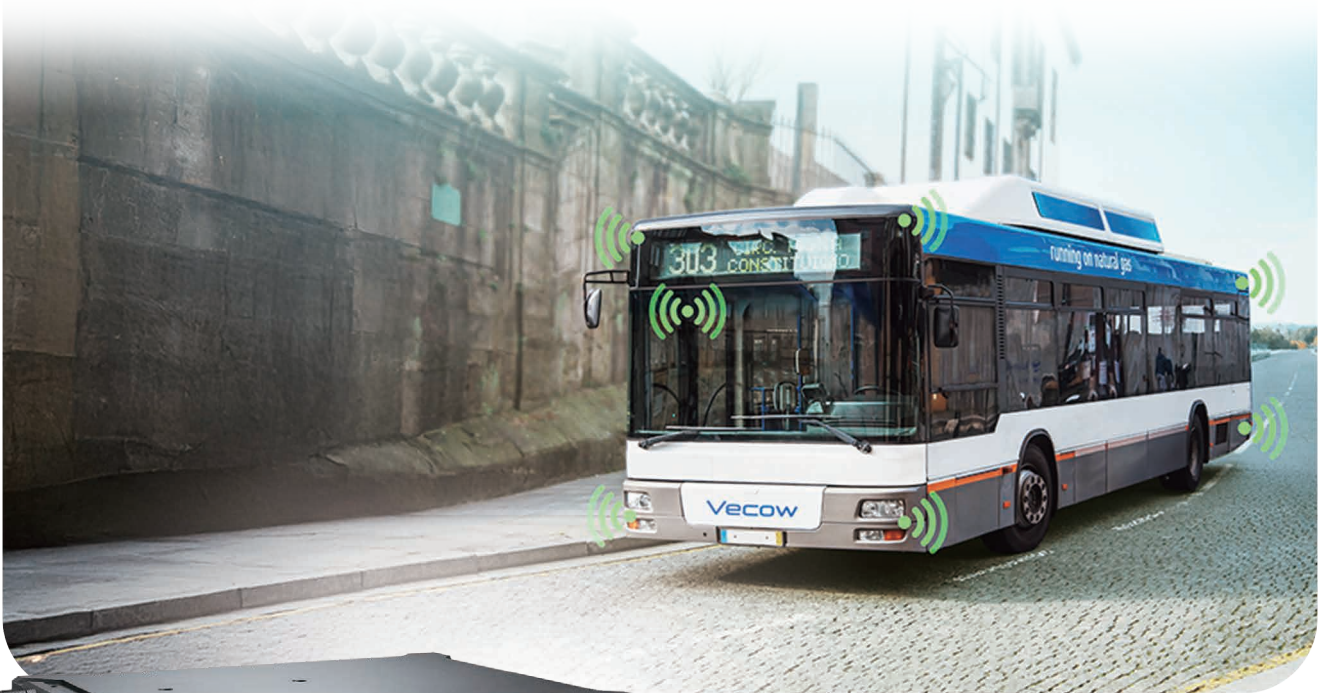
▲ V2X, Traffic Vision

Intel® Core™ 200S Series and 14/13/12th Gen Intel® Core™ Processor Expandable Liquid Cooling AI Computing System